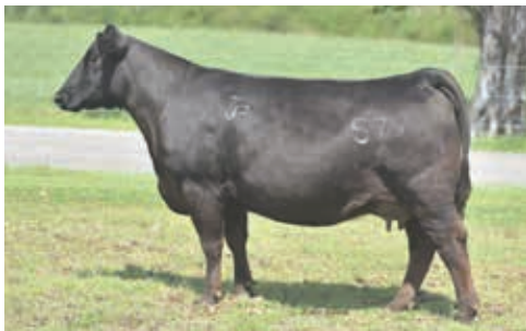
Anissa 921U 579C ET Dam of Lots 54 & 55

140J also sells bred to Fronrunner and is due 8-31-23.