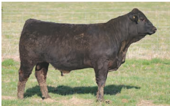
TAYD 823T Empire K152 ET / Lot 21