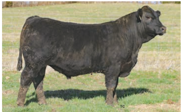
TAYD Z0138 Baller K202 ET / Lot 24