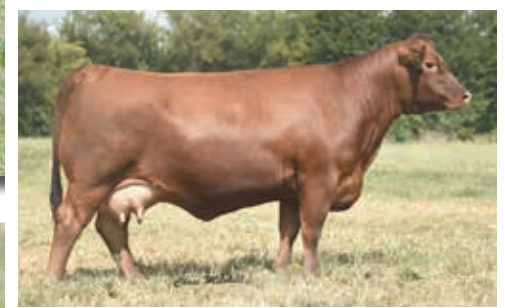
Blackbird 827T 410B ET Dam of Lots 13 & 14

Lots 13 & 14 We are offering 2 full brothers with different colors sired by Seminole Wind from our great donor cow, 410B. We have been very pleased also with the few Seminole Wind calves we have had and 410B is a no miss female.