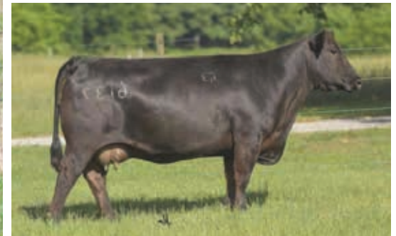
Anissa 921U 6137E ET / Dam of Lots 11 & 12

K122 is another son of 6137E. We have been very pleased with the Sand Trap sons and daughters in our herd.