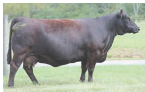
Blackbird 9034 128X ET / Dam of Lot 49

164J is a Baller female out of our first crop of Baller calves. I think you can see that he has done some good things for us. Her dam was a full sister to the dam of the first three lots. She sells bred to Fronrunner for a HB/HP purebred calf and is due 8-31-23.