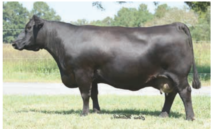
Anissa 921U ET / Dam of Lot 50 and maternal grandam of Lots 51-55

6138E is an Outright daughter of 921U and a full sister to 6137E. 6138E is HB/HP and possesses a very balanced EPD profile. She also is raising a big, stout Probrity son that will sell well this fall. There will not be many chances to buy 921U daughters so give this one a look. If you aren't familiar with 921U, she produced Rebel Yell that won the bull futurity and champion bull in 2020 at the NWSS. She sells bred to 1100J which will be a linebred 921U progeny. She is due 10-20-23.