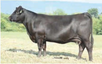
Anissa 359Z 588C / Dam of Lot 56