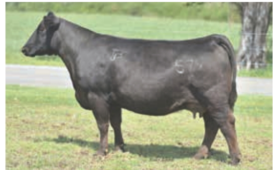
Anissa 912U 579C / Dam of Lots 52-55