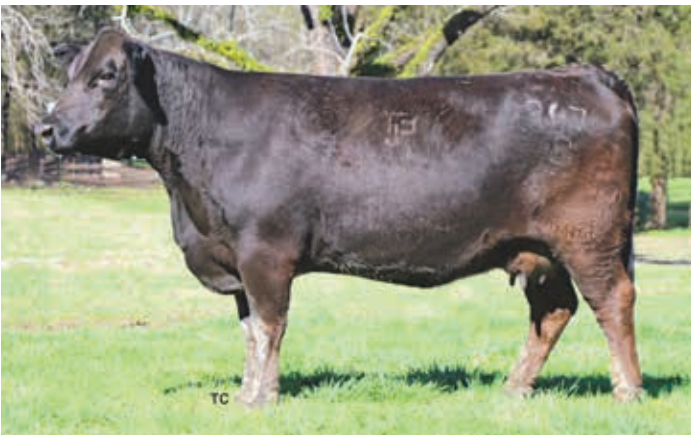
Anissa 588C 967G ET / Lot 56

This calf combines two of the great success stories at TJB. Of course we have emphasized the importance of 337M but the sire of this heifer, Dominic is still the highest priced bull we have sold at auction. We continue to use Dominic and really love the type. They are all soft made, easy fleshing, and eye appealing.