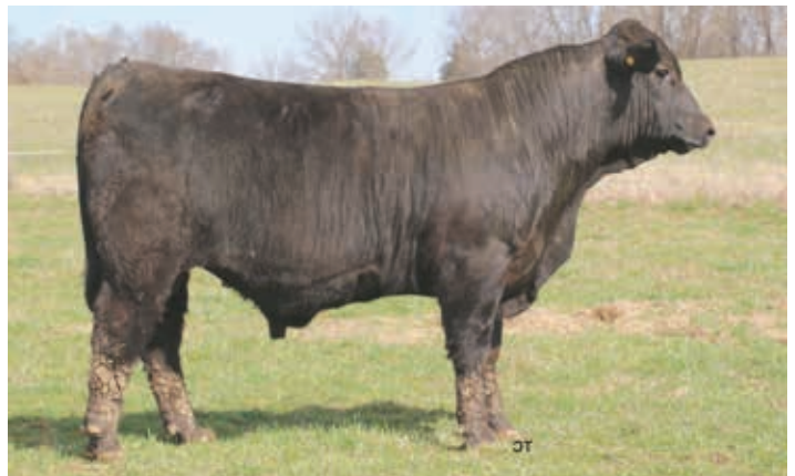
TAYD 823T Empire K132 ET / Lot 17