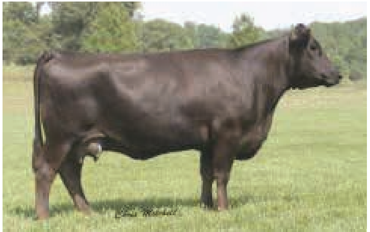
Blackcap B042 823T ET / Dam of Lots 15 - 21