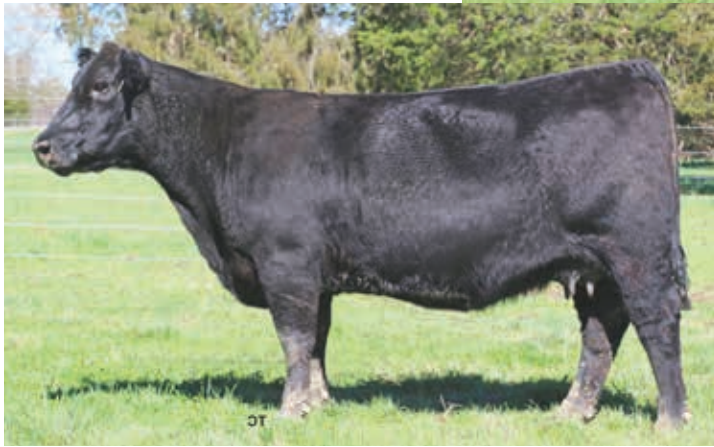
Ms Probity 8381F / Lot 61

Lot 60 VANESSA 4103C 026H ET Cow AMGV1509804 Classification: BA38 Breed Comp: GV44% AN56%