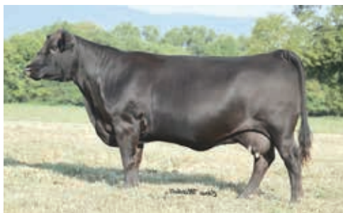
Blackbird 9034 130X ET Dam of Lots 44-46

861F is another beautiful daughter of 130X. 130X is a Masterpiece female from a great Angus donor we incorporated to make Balancers, 9034. I think you will appreciate the style and structure in these cattle we are offering in this sale. 861F sells bred to BTBR Saguario and is due 9-16-23.