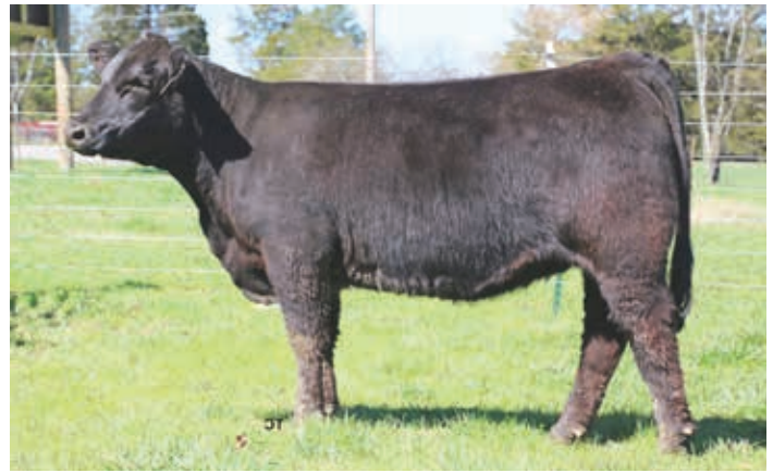
Anissa 4104C 156J / Lot 51

J301 sells bred to Rebel Yell for 8-31-23 due date.