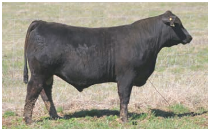
TAYD 4102C Cowtown K092 ET / Lot 7