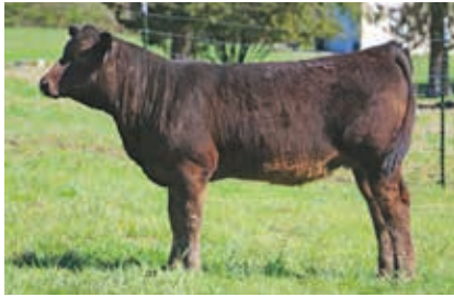
Anissa 5104C 2131K / Lot 57A