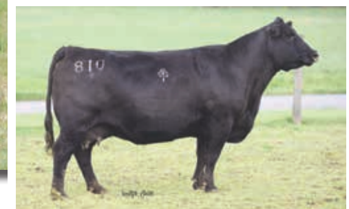
TCC Rita 018 / Dam of Lot 29

Lot 28 H100 DA76 K100 BULL AMGV1560717 Classification: BA50 Breed Comp: GV50% AN25%