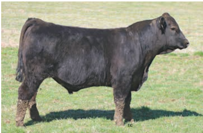
TAYD 823T Empire K172 ET / Lot 19