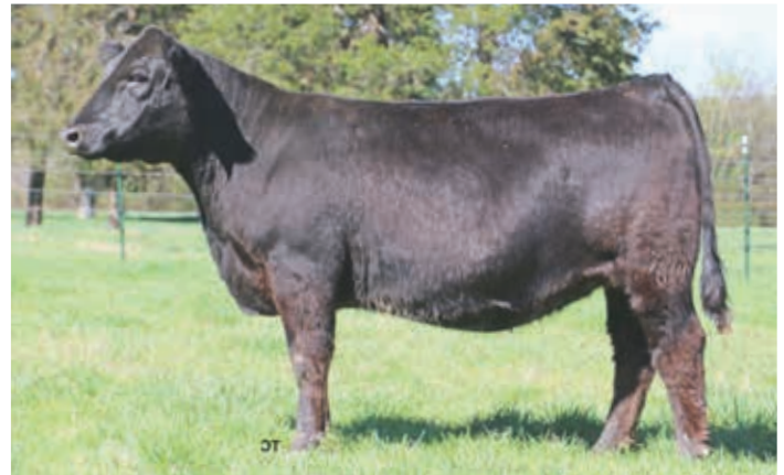
Anissa 579C J361 ET / Lot 52