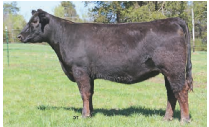
Anissa 579C J301 ET / Lot 53