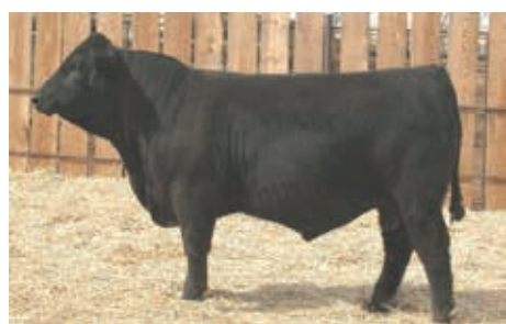
BTBR Saguario 811F ET Sire of Lot 58A

2132K is one of our first Saguario calves. She not only looks good, she also carries some impressive growth EPD's. Juniors take a look. She can have a successful show career.