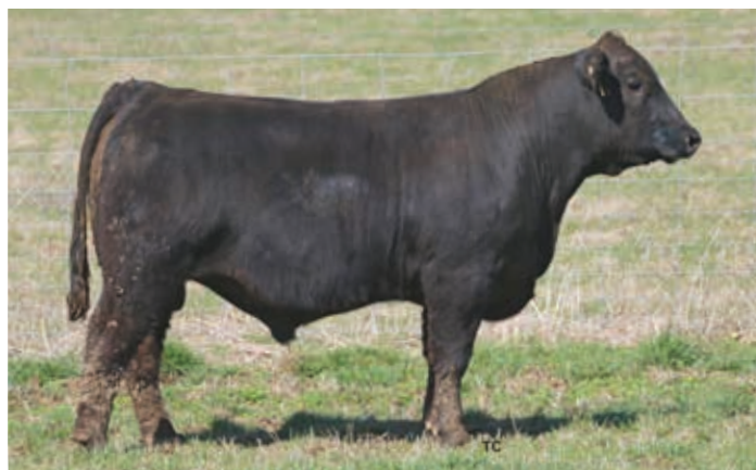
TAYD 4102C Cowtown K082 ET / Lot 6