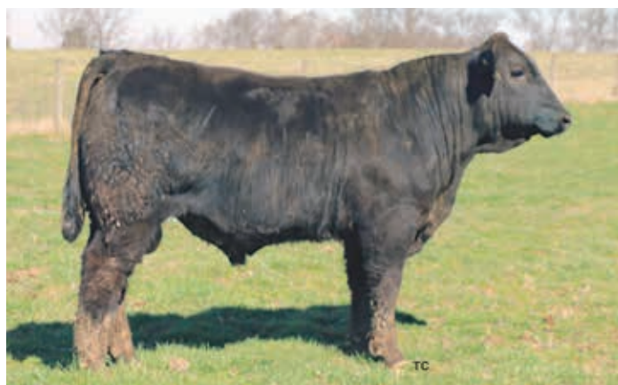
TAYD 4102C Cowtown K072 ET / Lot 8

To View Videos of the sale offering visit www.tjbgelbvieh.com