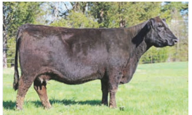
Anissa 921U 4102C ET / Dam of Lots 1-8