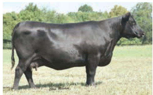
Three Trees Everelda Z0138 / Dam of Lots 22-24

Lots 22-23 We liked this mating so well after seeing the acceptance of these bulls in last year's sale, we did it again! These bulls have more frame than some of our other matings and they will produce pounds.